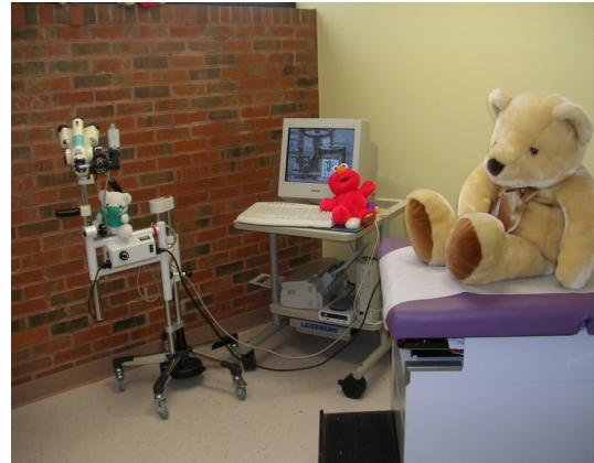
The Examination Room

The medical evaluation is a non-invasive child check-up that is provided to determine if any physical signs of trauma exist. The exam may also require the completion of laboratory work to ensure the child is healthy. At TEDI BEAR, exams are primarily external. Examinations are completed by a pediatrician, or other licensed medical provider. The medical provider will also obtain information from the caregivers about the child's medical history.