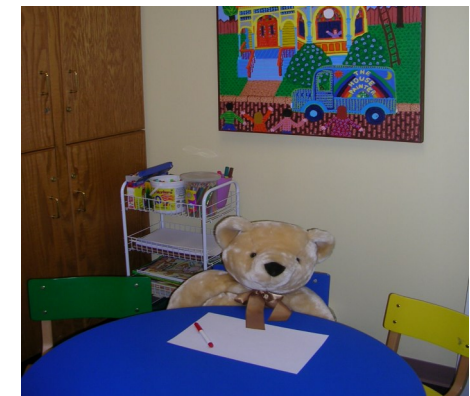
The Interview Room

A social worker will provide a one-on-one interview with the child to obtain accurate information. The interviewer is trained to understand their cognitive development and emotional needs. The interview takes place in a child-friendly room and is monitored in by professionals including Law Enforcement and DSS. Caregivers are not permitted to observe the interview to maintain the integrity of the investigation.